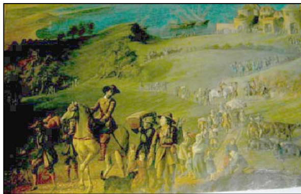
Huguenot refugees arriving in 1695 from a painting in the Walloon chapel

The Delasaux Family came to Canterbury in 1572 as Huguenot refugees